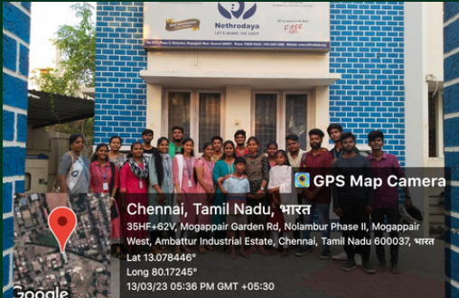
SOCIAL SERVICE ACTIVITY