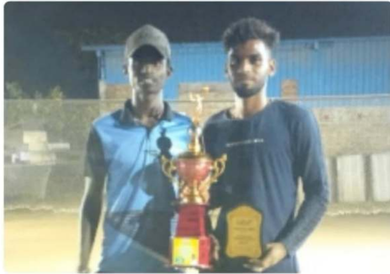
GOUTHAM-2C VOLLEYBALL DISTRICT PLAYER