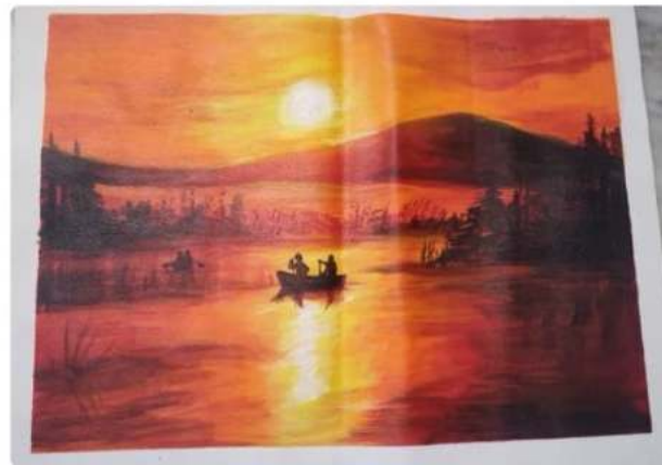
Reshma Showkath 1D