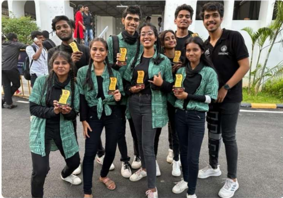
The A&F dance team won the dance competition in Artistics'23