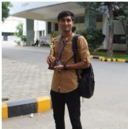
Suhail-1B Mr.Vfest at Vfest'22