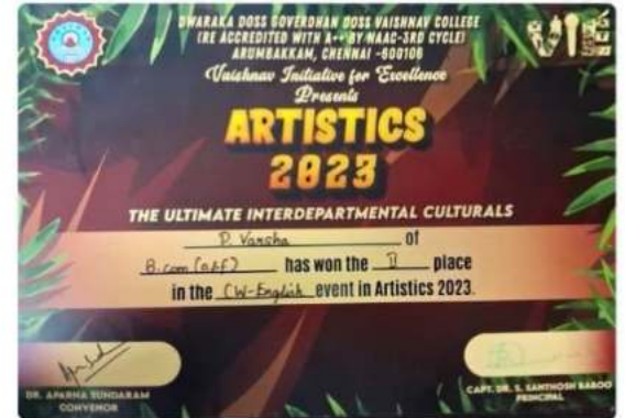
Varsha-1B 2nd place for Creative Writing at Artistics'22