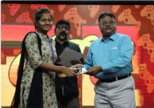
Varsha-1B 2nd place for Creative Writing at VFest'22