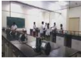
Lab 2 – Applied Microbiology