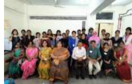
Implementation of Training Program