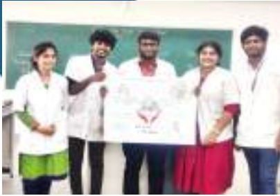
Promoting Environmental sentence