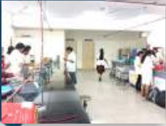
Lab1 - Medical Microbiology