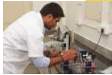
Lab-3 Immunology and Molecular Biology