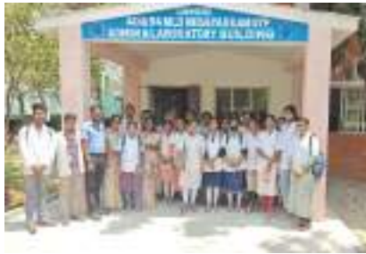
Regular industrial Visit