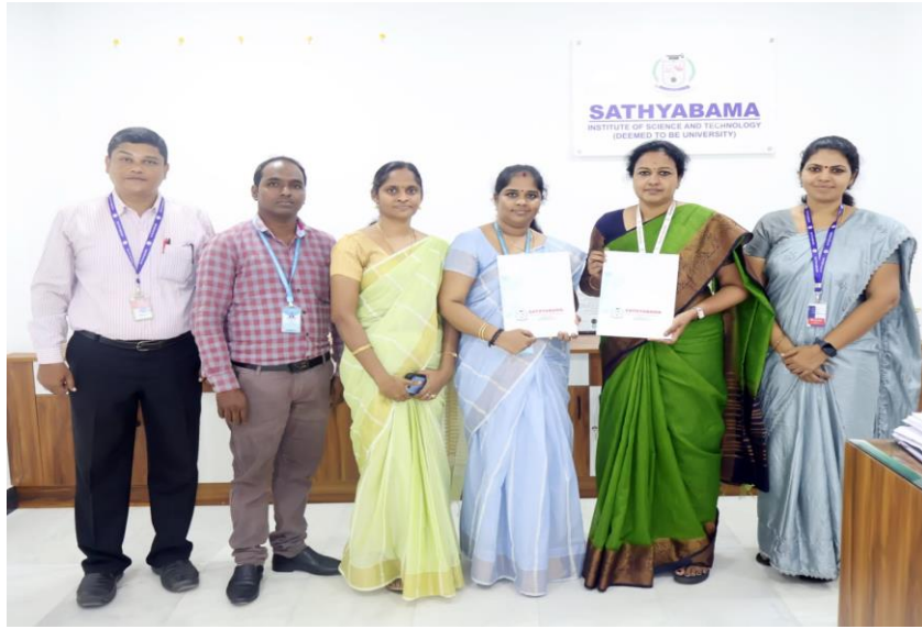
MoU signed with Sathyabama Institute of Science and Technology

Re-Accredited with A++ Grade by NAAC College with Potential for Excellence, Linguistic Minority Institution Affiliated to University of Madras, Arumbakkam, Chennai – 600 106