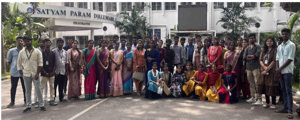
Department Alumni meet held on 02.03.2024