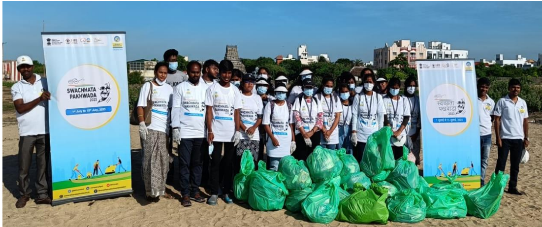
COASTAL CLEAN-UP Extension Activity in association with the Indian Army and Trisakha foundation Besant Nagar Beach, Chennai held on 15-07-2023.

College with Potential for Excellence, Linguistic Minority Institution Affiliated to University of Madras, Arumbakkam, Chennai – 600 106