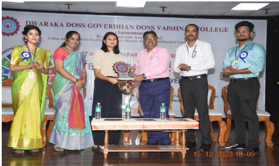
TECHNO SAVIOUR 2023 held on 15.12.2023