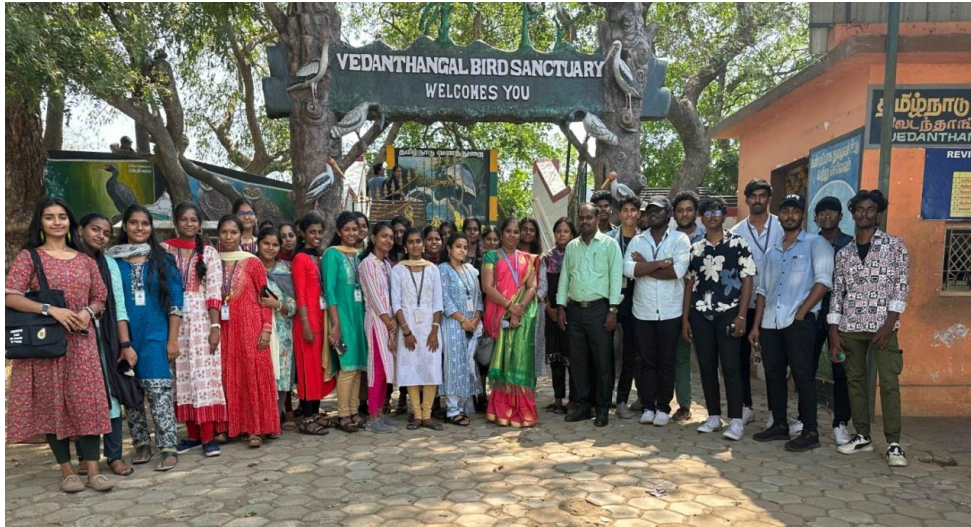
Environmental Studies field visit to Vedanthangal Bird Sanctuary held on 08.03.2024.

College with Potential for Excellence, Linguistic Minority Institution Affiliated to University of Madras, Arumbakkam, Chennai – 600 106