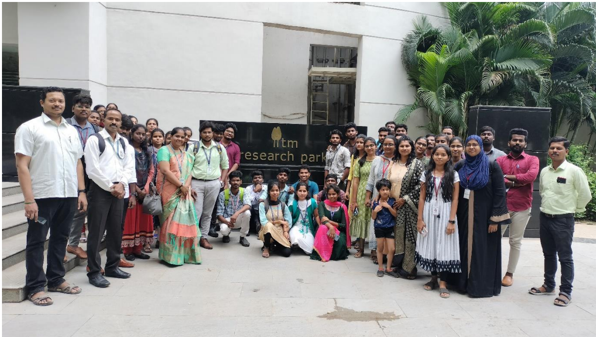
Visit to CanBrs Therapeutics Private Limited, IIT Madras Research Park, Taramani held on 23-08-2023