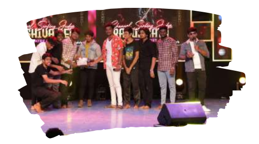
PRADARSHINI- KMC CHANNEL SURFING- 1ST PLACE