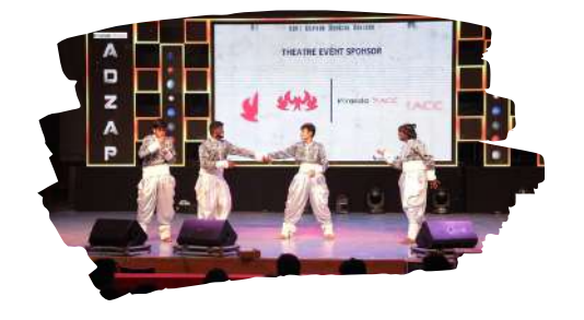
REVIVALS – MMC CHANNEL SURFING -2ND PLACE