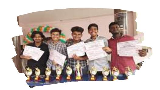
BANCO - ETHIRAJ COLLEGE OVERALLS - WINNERS CHANNEL SURFING – 1ST PLACE ADZAP -1ST PLACE