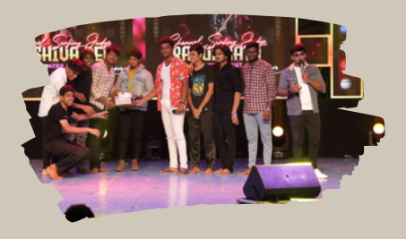
PRADARSHINI- KMC CHANNEL SURFING- 1ST PLACE