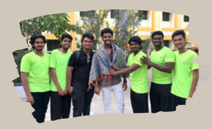
DETRIX -MGR UNIVERSITY CHANNEL SURFING – 1ST PLACE