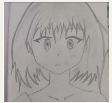
BHAVIS R S I MA English