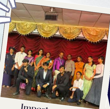
Importance of Being Earnest

“Charlie and the Chocolate Factory” has been adapted into multiple stage productions, both as a play and a musical. It is based on Roald Dahl’s classic 1964 novel about a poor boy, Charlie Bucket, who wins a golden ticket to tour Willy Wonka’s magical chocolate factory alongside four other children with exaggerated personality flaws.