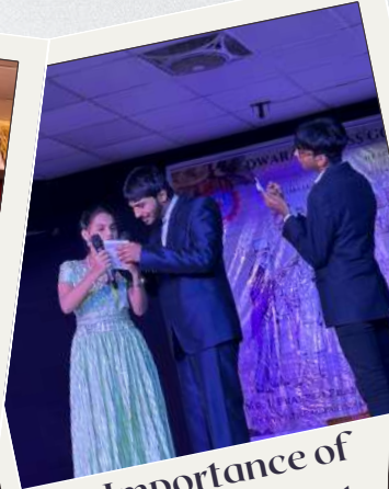
Importance of Being Earnest