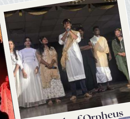
Myth of Orpheus and Eurydice

“The Importance of Being Earnest” is a famous comedy play by Oscar Wilde, first performed in 1895. It is a satirical play that mocks Victorian society’s obsession with social status, marriage, and appearances.