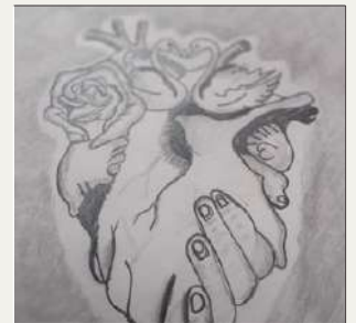
Poojasumi . G - IBA