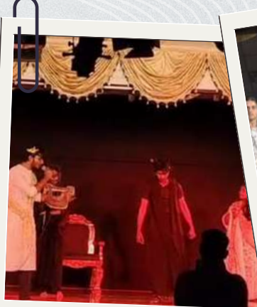
Myth of Orpheus and Eurydice