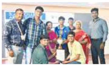
▶ College Chess Men Win Madras B Zone Title

Our College Chess Men Team emerged victorious in the University of Madras B Zone Chess Championship, held at SA Arts and Science College. The team demonstrated exceptional strategic skills, concentration, and teamwork, bringing pride and recognition to the institution through their commendable achievement.