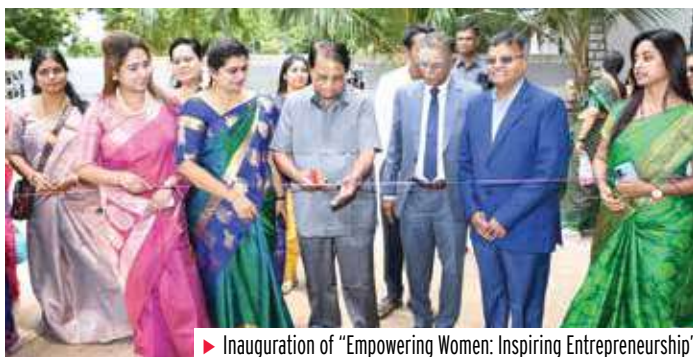
▶ Inauguration of "Empowering Women: Inspiring Entrepreneurship"

Dwarka Doss Goverdhan Doss Vaishnav College, in collaboration with the Women Entrepreneurs Welfare Association (WEWA), organised an Entrepreneurship Training Programme titled "Empowering Women: Inspiring Entrepreneurship" on 22 September 2025.