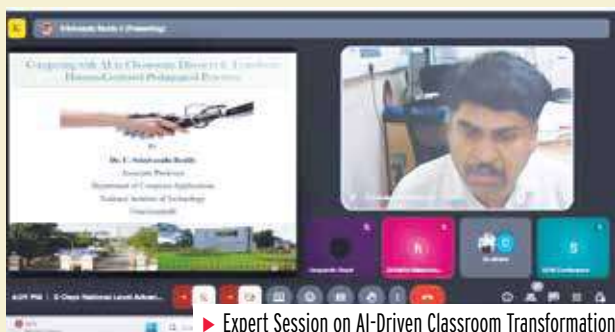
▶ Expert Session on AI-Driven Classroom Transformation