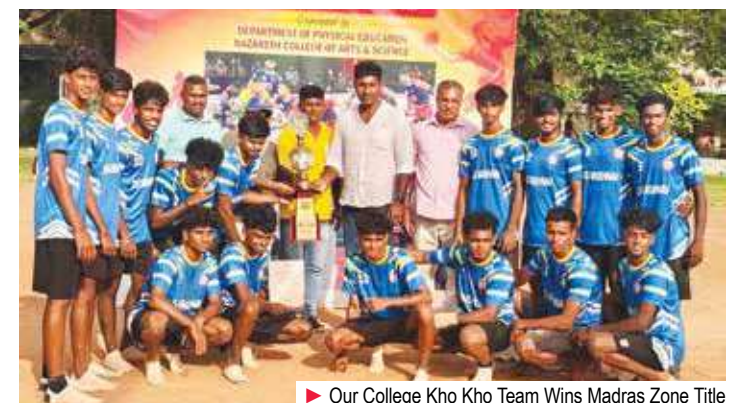
▶ Our College Kho Kho Team Wins Madras Zone Title

Our College Chess Men Team emerged victorious in the University of Madras B Zone Chess Championship, held at SA Arts and Science College. The team demonstrated exceptional strategic skills, concentration, and teamwork, bringing pride and recognition to the institution through their commendable achievement.