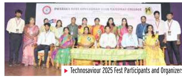
► Technosaviour 2025 Fest Participants and Organizers