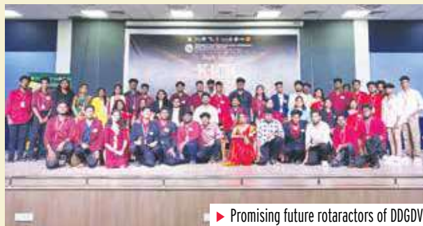
► Promising future rotaractors of DDGVC