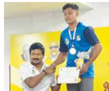
team's overall success.

The Chief Minister Trophy is one of the most prestigious state-level basketball tournaments in Tamil Nadu, attracting highly competitive teams from across the districts. Competing in such an elite tournament requires not only exceptional physical fitness and skill but also unwavering determination, strategic thinking, and strong teamwork. Our students demonstrated all these qualities and showcased exemplary performance throughout the tournament, contributing to the