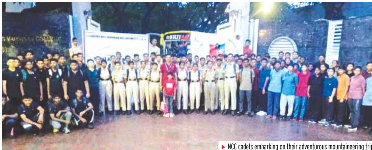
► NCC cadets embarking on their adventurous mountaineering trip