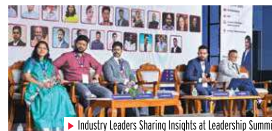
▶ Industry Leaders Sharing Insights at Leadership Summit

The initiative included repainting school blocks, improving sanitation, and supporting kitchen renovation, reinforcing the institution’s commitment to community welfare.