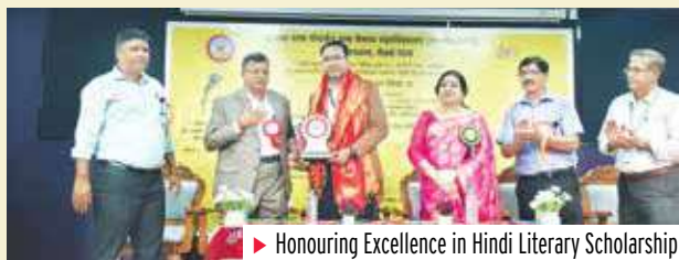
▶ Honouring Excellence in Hindi Literary Scholarship