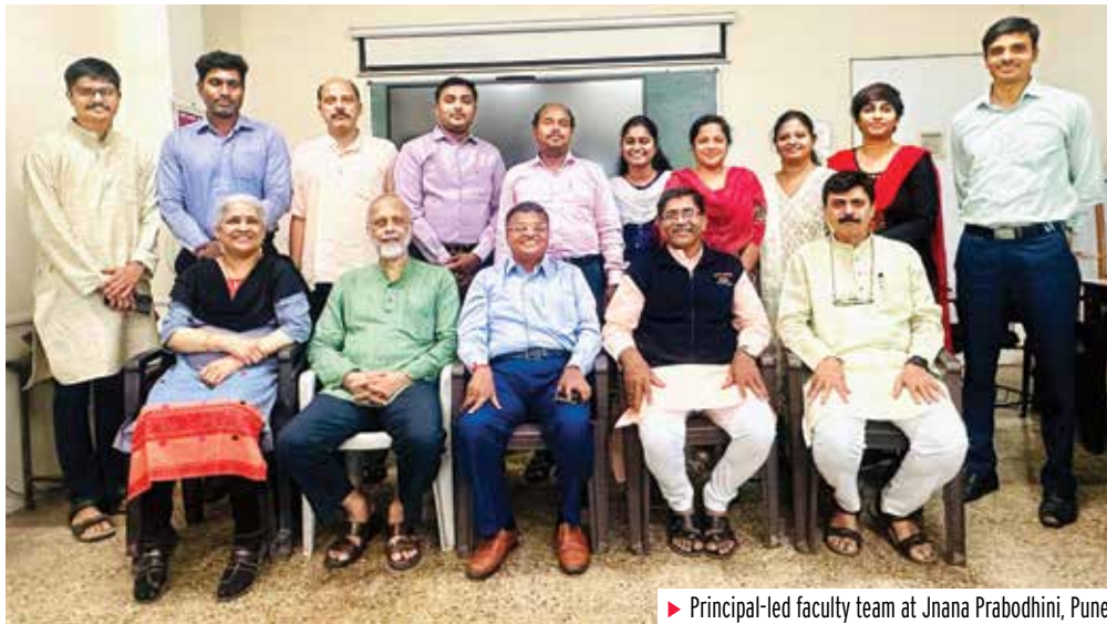
▶ Principal-led faculty team at Jnana Prabodhini, Pune.