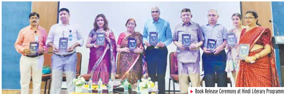
▶ Book Release Ceremony at Hindi Literary Programme