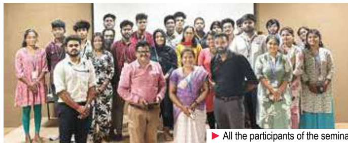
► All the participants of the seminar

The Department of Visual Communication, Dwarka Doss Goverdhan Doss Vaishnav College, organized a one-day interdepartmental workshop titled Aesthetic Lens: Crafting Photos and Careers Workshop on 26 September 2025 at the Computer Lab, Ganga Block. The offline session was led by Mr. Pramod Mani, Sigma Ambassador. Twenty-four students and two faculty members participated. Students gained hands-on skills in photography, photo editing, portfolio building, branding, and realistic insights into career opportunities, industry challenges, and professional growth. The event strengthened confidence and career readiness among participating communication students.