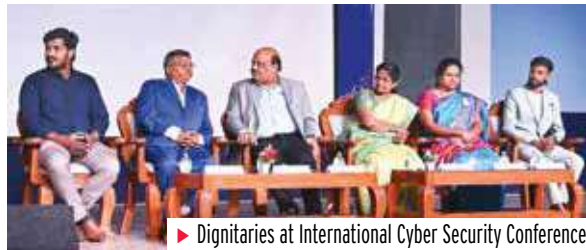
► Dignitaries at International Cyber Security Conference