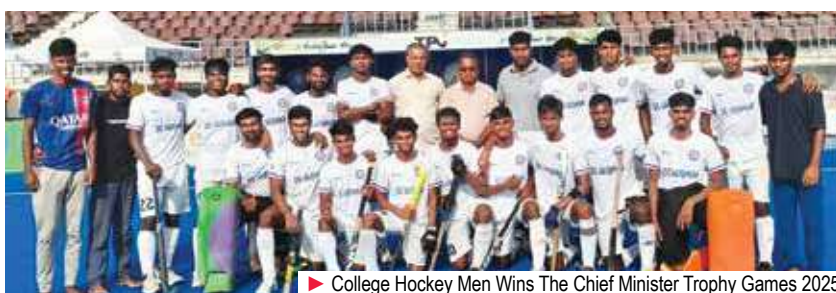
▶ College Hockey Men Wins The Chief Minister Trophy Games 2025

The College Hockey Men Team emerged as winners in the Chief Minister Trophy Games 2025 at the district level, showcasing excellent teamwork, skill, and sportsmanship. Their commendable performance brought pride and recognition to the college.