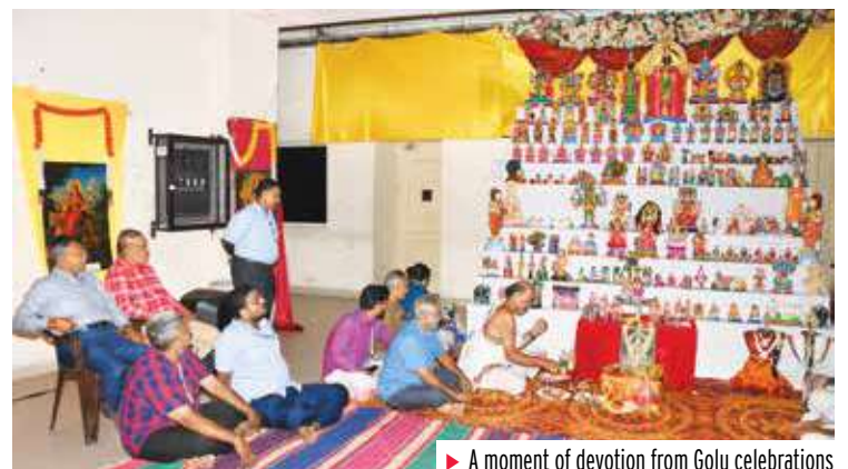
▶ A moment of devotion from Golu celebrations