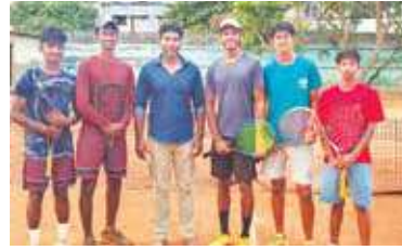
▶ DGVC Students Win Gold at Chief Minister Trophy