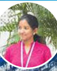
B.Com PA (1st Year - Shift II)