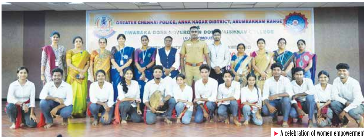
► A celebration of women empowerment

cadets to overcome fear, build confidence, and develop leadership qualities. It was well-planned and safely conducted under the guidance of trained instructors from the Tamil Nadu Mountaineering Association.