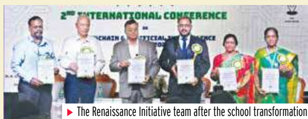
▶ The Renaissance Initiative team after the school transformation

The seminar concluded with a valedictory address and certificate distribution.