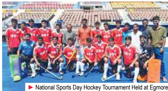
▶ National Sports Day Hockey Tournament Held at Egmore

rating National Sports Day, which celebrates the birth anniversary of hockey legend Major Dhyan Chand.