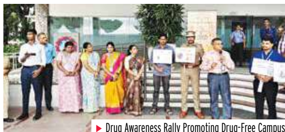
► Drug Awareness Rally Promoting Drug-Free Campus

solutions addressing environmental and social challenges. The event promoted networking, interdisciplinary collaboration, and knowledge sharing aligned with global sustainability goals. Outstanding contributions were recognized through Best Paper and Best Presenter Awards, motivating further research and innovation. The valedictory session emphasized the importance of continuous research, collaboration, and ethical practices in achieving sustainable development, marking the conference as a meaningful and impactful academic initiative.