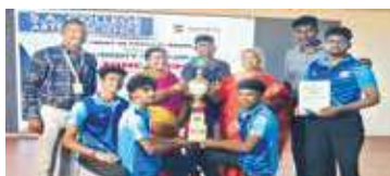
▶ Our College Claims Madras B Zone Title

Our college Table Tennis team achieved a commendable victory by winning the University of Madras B Zone Table Tennis Championship held at SA Arts and Science College. The team displayed excellent skill, coordination, and sportsmanship throughout the tournament, bringing pride and recognition to the institution.