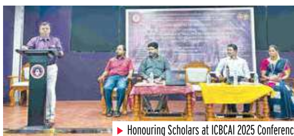
▶ Honouring Scholars at ICBCAI 2025 Conference