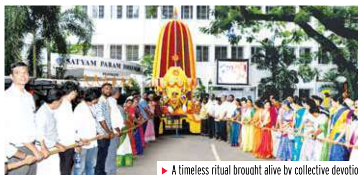
▶ A timeless ritual brought alive by collective devotion