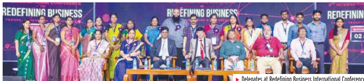
► Delegates at Redefining Business International Conference

Scholars, industry experts, and students discussed AI, fintech, workforce trends, and innovation through keynotes, panels, and research sessions, concluding with awards and valedictory addresses.