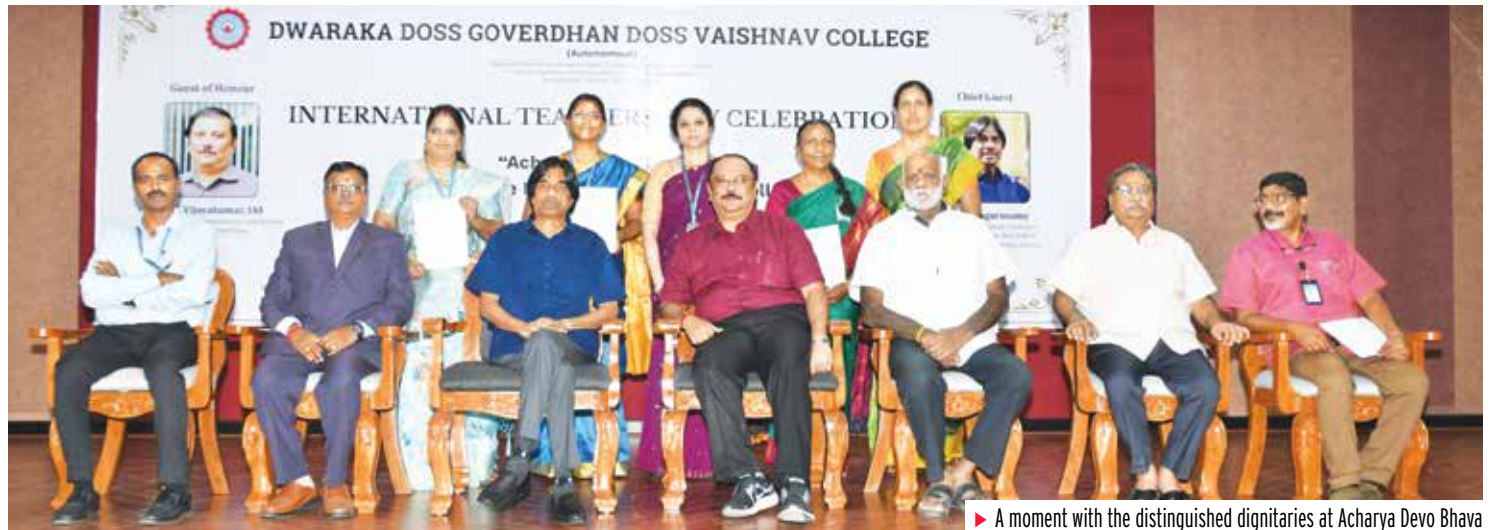
▶ A moment with the distinguished dignitaries at Acharya Devo Bhava