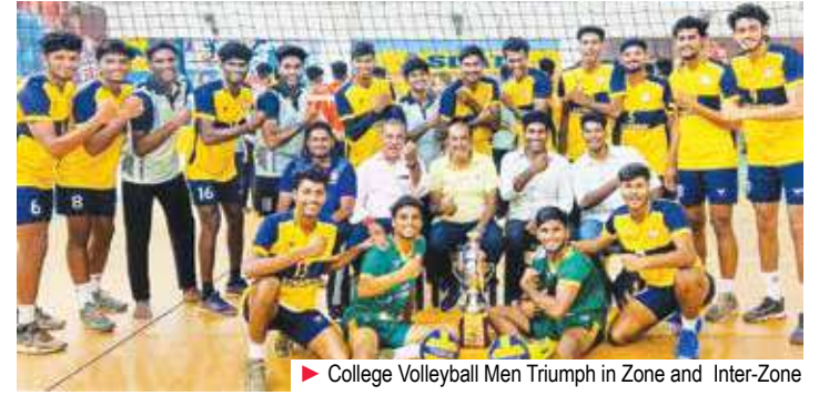
▶ College Volleyball Men Triumph in Zone and Inter-Zone

For the first time, DGVC made history by emerging as winners in the University of Madras Inter-Zone Tennis Tournament. The team's exceptional skill, teamwork, and determination brought pride and recognition to the college.