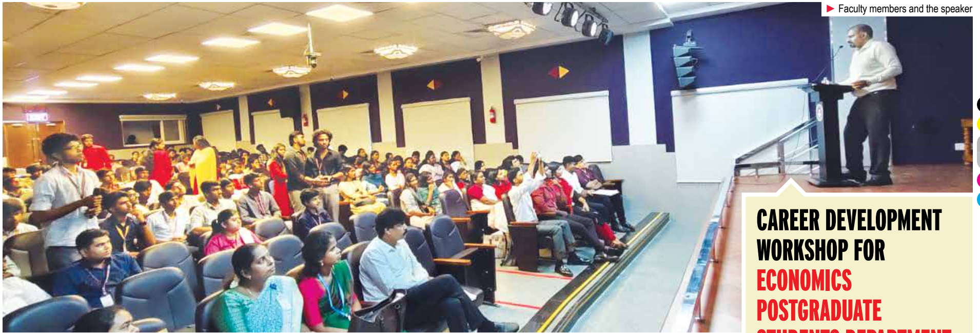
► Faculty members and the speaker