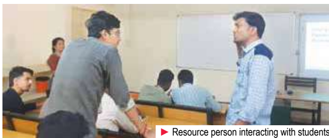
► Resource person interacting with students